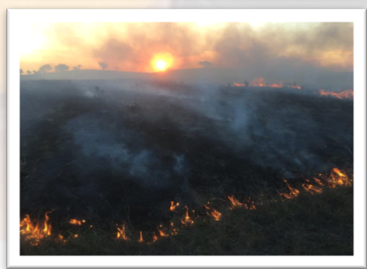
Gungaderra grasslands: the broken fuel line of this cultural burn allows for small animal escape routes.