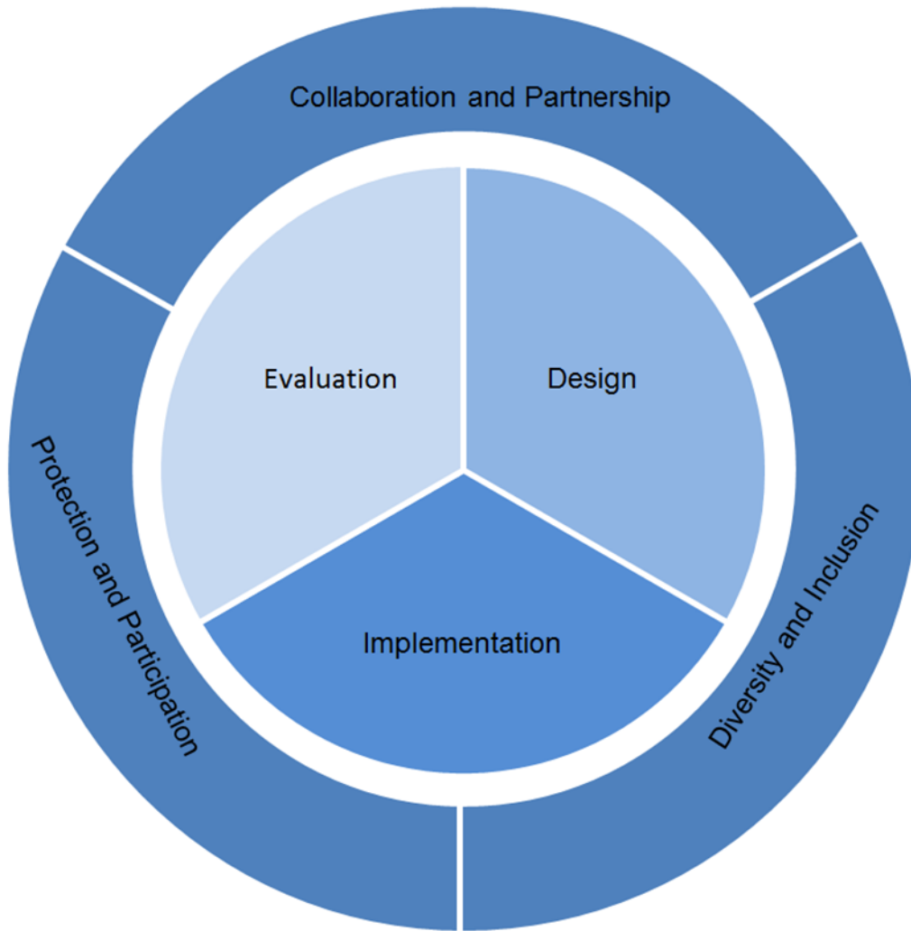
Figure 2. Disaster Resilience Education Practice Framework