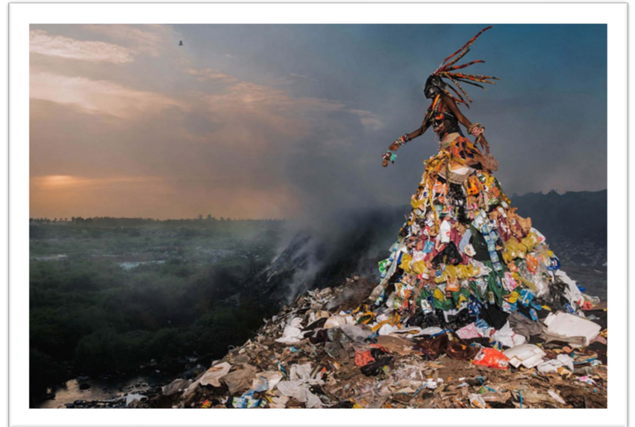
THE PROPHECY 2016