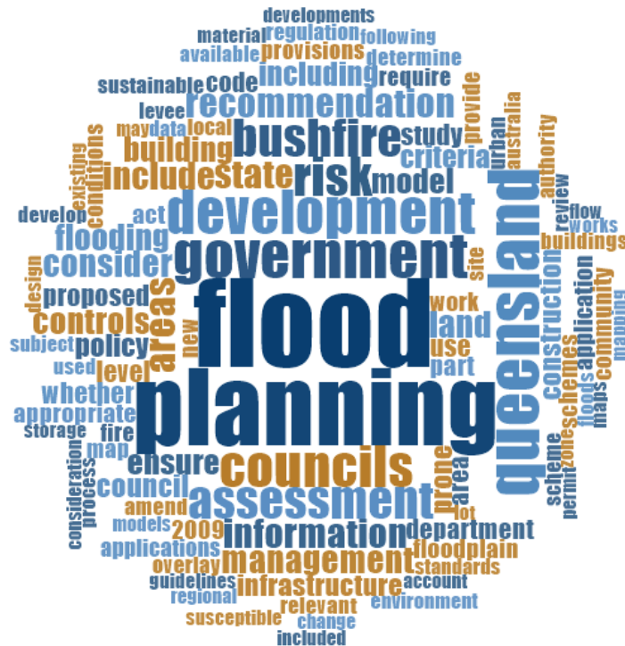
FIGURE 3. WORD FREQUENCY CLOUD FOR URBAN-PLANNING-RELATED RECOMMENDATIONS

As Figure 3 indicates, the words flood , and planning are the most used, with bushfire also being quite frequent. The table below shows the top 25 most frequent words in the corpus of 137 UP-related recommendations. Relevant UP-related terms that have made it to this list include: development, risk, information, land, controls, building and policy . While the visualisation of these frequencies is a good start to getting acquainted with the scope of the recommendations, they cannot be directly related to the number of recommendations that utilise these terms, as some may use them repeatedly. Nevertheless, these frequencies are still useful to understand broad topics that have permeated the collection of UP-related recommendations.