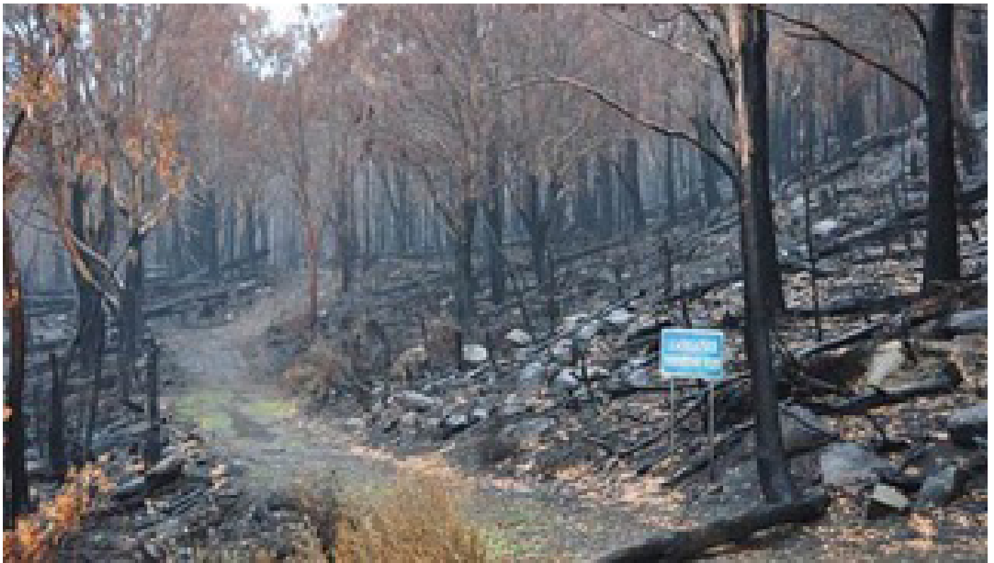
The Lake Mountain toboggan run two months after the Black Saturday bushfires.