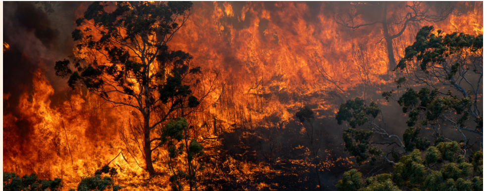
▲ Above: BUSHFIRE RAGING AT THE NORTH BLACK RANGE IN NSW, DECEMBER 2019.

The research builds on previous NSW RFS contracted research relating to