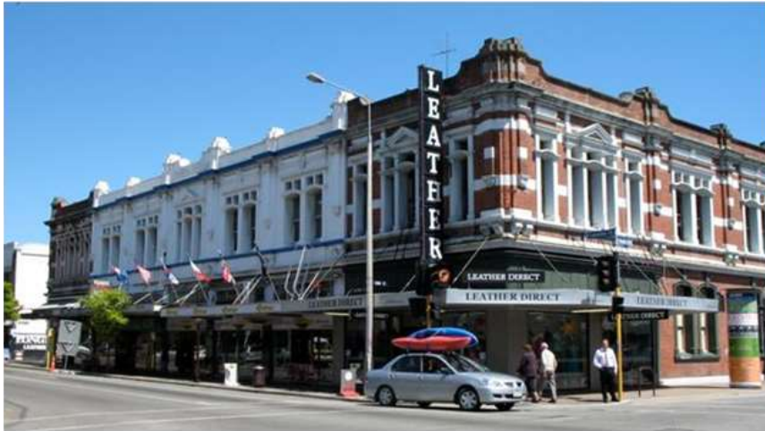
Christchurch corner shops