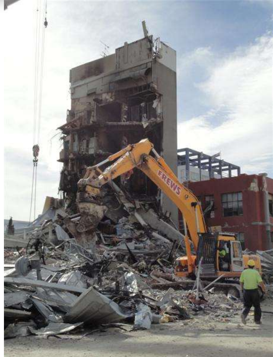
CTV – 115 fatalities