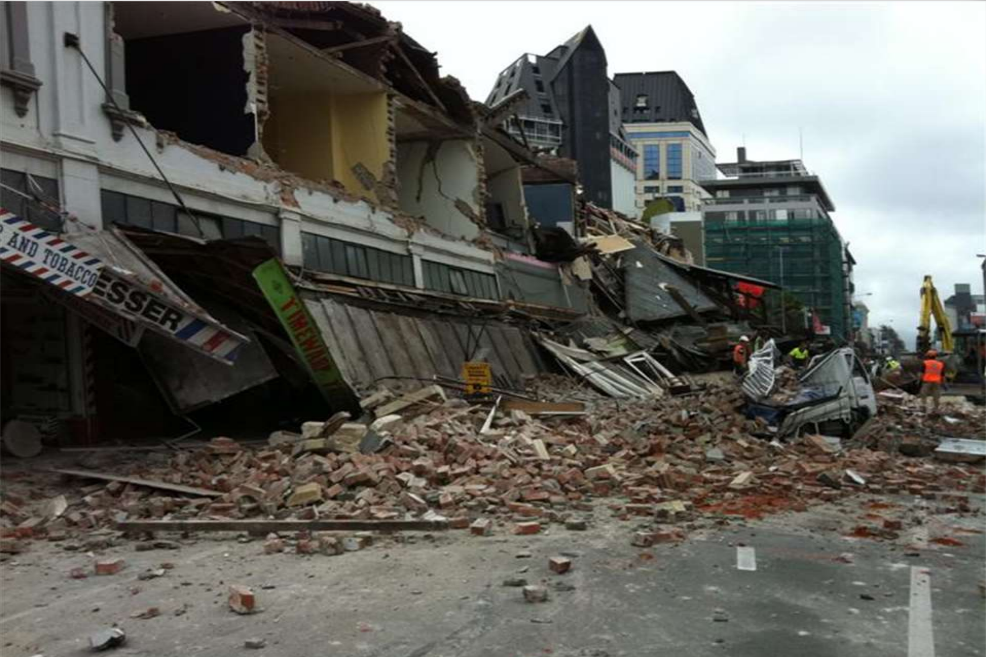
Out-of-plane wall bending failures in Christchurch (42 fatalities in URM buildings)