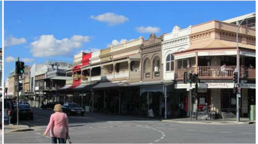
Adelaide corner shops