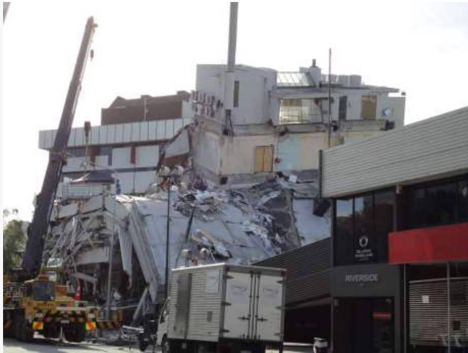
PGC – 18 fatalities