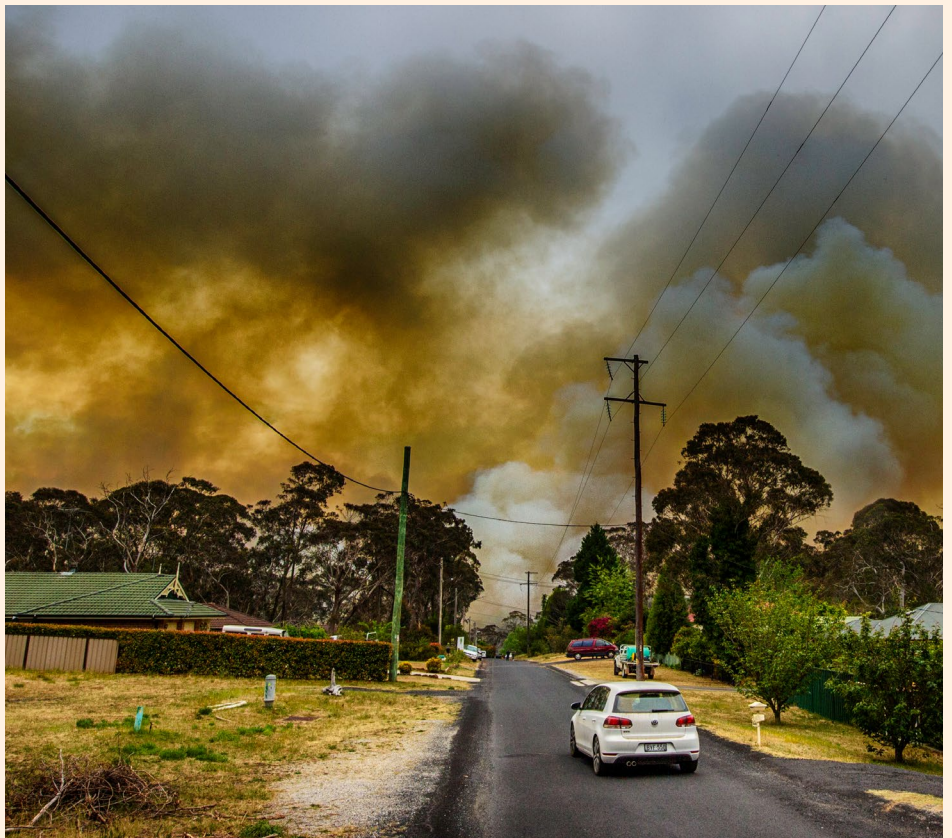
▲ Above: THE STATE MINE FIRE IN THE BLUE MOUNTAINS, OCTOBER 2013, SPREAD ABNORMALLY FAST FOR THE WEATHER CONDITIONS DUE TO A WEATHER PHENOMENON KNOWN AS A MOUNTAIN WAVE.

One of the most challenging situations in fire management is when relatively benign weather conditions are expected, but a severe fire eventuates. These situations can result in significant loss of property or even life. Identifying the cause of such incorrect expectations can help to prevent them from recurring in the future. Analysis of the meteorology of recent bushfires has now uncovered three cases (the State Mine fire, New South Wales, 2013, the Margaret River fire, Western Australia, 2011, and the Aberfeldy fire, Victoria, 2013) where a weather phenomenon known as mountain waves has contributed to the severe fire behaviour. Mountain waves are atmospheric oscillations that occur due to air flowing over hills or mountains. They can arise in several different ways, some more predictable than others. Often they cause strong downslope winds on the