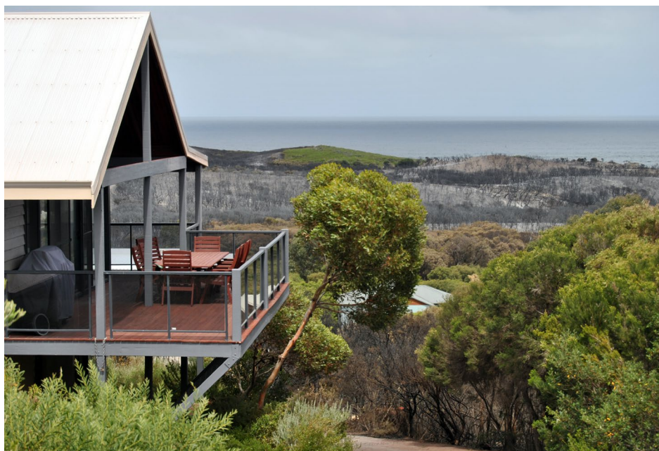
▲ Above: A MOUNTAIN WAVE CAUSED THE ESCAPE OF THE PRESCRIBED BURN NEAR MARGARET RIVER IN NOVEMBER 2011, EVEN THOUGH THE HILL THAT RESULTED IN THE DOWNSLOPE WINDS WAS ONLY AROUND 200M HIGH. 39 HOUSES WERE LOST.

These studies show the utility of high-resolution numerical weather prediction in diagnosing the cause of unexpectedly severe bushfires, and this utility should translate into skill in the forecast situation. But high-resolution numerical weather prediction contains a wealth of fine-scale three-dimensional detail, only a small part of which will be relevant to a