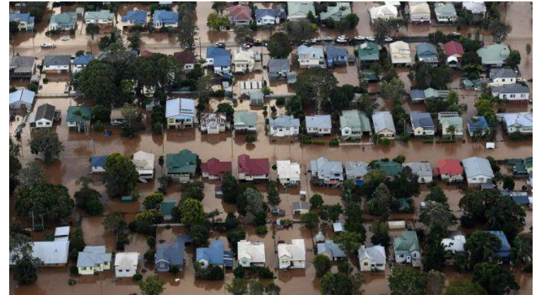
Lismore after Cyclone Debbie