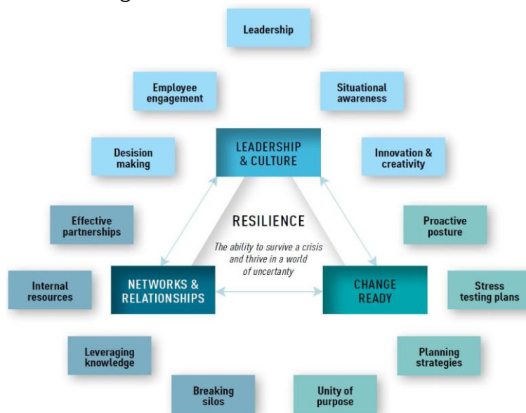
Figure 2: The Components of Resilience (Attorney Generals Department, 2016).

In the second study a survey was developed to assess decision-making in a series of crisis and emergency management exercises. The statements in the survey were based on the decision-making indicator in the Australian Government's Organisational Resilience Good Business Guide. The various components of resilience are shown in Figure 2.