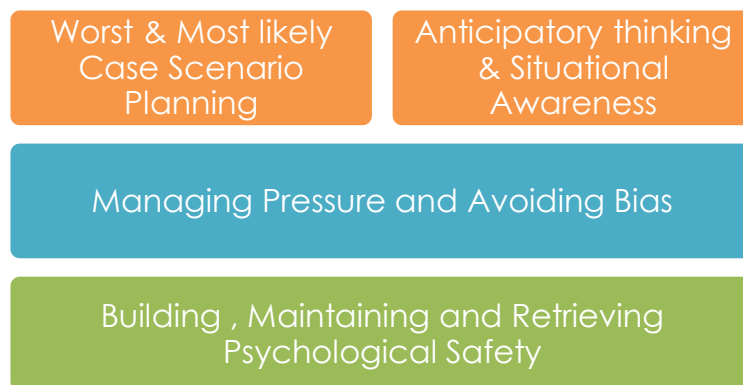
Figure 3: Modules of the Decision-Making Training Intervention

The third study involved a training intervention – a decision-making course where participants were trained in both knowledge and support skills that assist them in their decision-making. Figure 3 identifies the different modules included in the course. The two lower modules we considered the foundations of good decision-making, whereas the skills around scenario planning and anticipatory thinking we considered to be more advanced skills. Based on findings from the previous studies a set of checklists (aides-memoire) were developed. The participants then engaged in an exercise that had been specifically designed with injects to test the concepts in the aide-memoire, but embedded within a realistic emergency scenario.