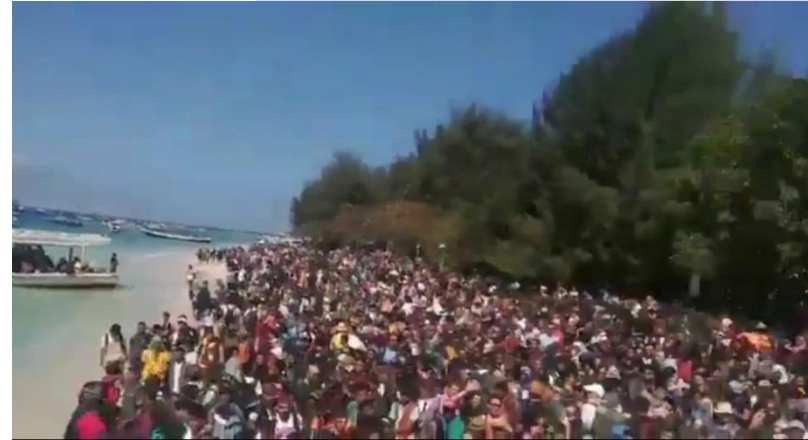
Basarnas personnel, "Tourists on the beach of Gili Trawangan, waiting to evacuate".