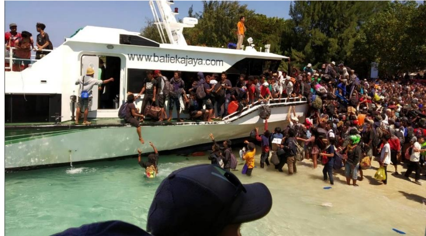
AP, “Rescue vessels are said to be leaving half empty with ‘selected’ evacuees”.

“People are punching and hitting each other.” (Interviewee)