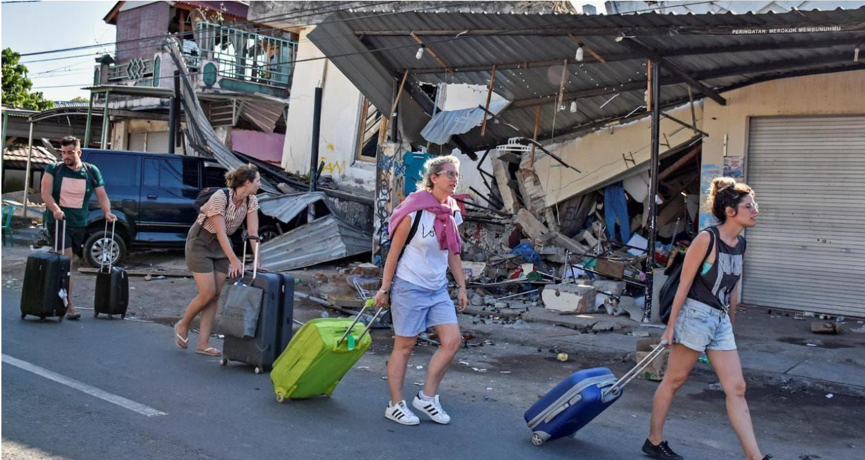
The Cairns Post, "Bali resort town is back in business after Lombok quake".