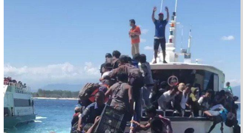
One News Page, "Terrified tourists flee Gili Islands after Lombok quake"