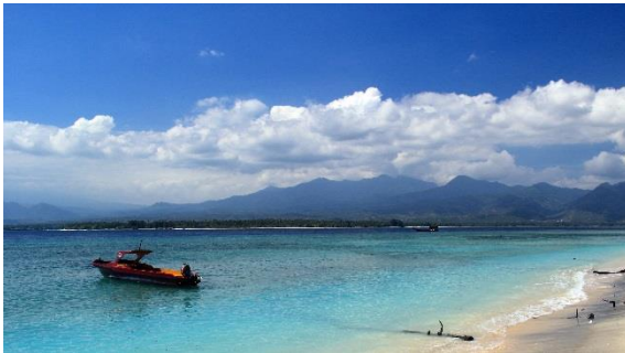
Laurent Bigué, Gili Air Eastern coast looking at Lombok”.