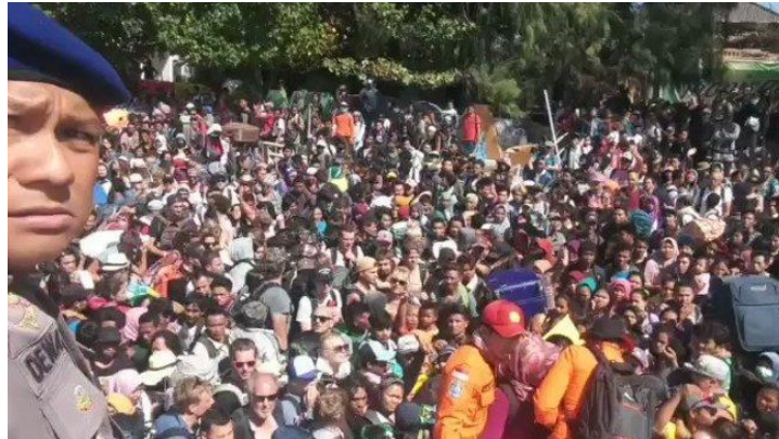
"Tourists on the beach of Gili Trawangan, waiting to evacuate"

Almost all the tourists evacuated soon after the quake (74%) while those who stayed were mostly local residents and expats