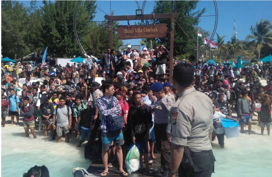
"People attempting to leave Gili Trawangan on the day after the quake"

Response was uncoordinated and there was insufficient transport capacity to account for the mass exodus