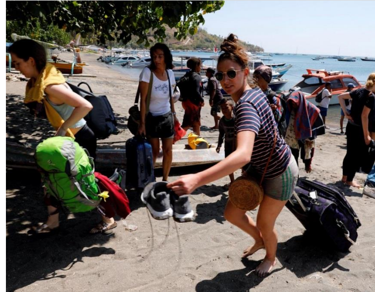
"Tourists carry their belongings as they leave Gili Trawangan".

Almost all interviewees were between 18 and 60 years old