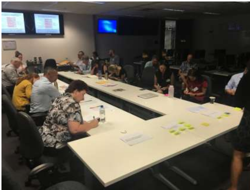
Figure 2 – End user workshop at April 2018 RAF