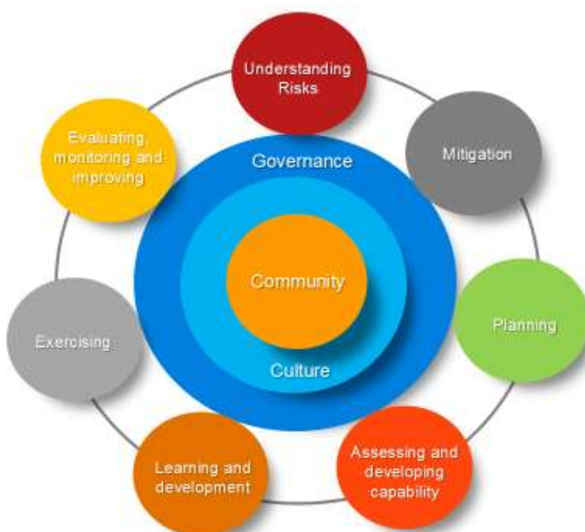
Figure 1 – Preparedness System

To enable the development of a benchmarking tool the literature review was utilized to define a preparedness framework. This is shown in Figure 1.