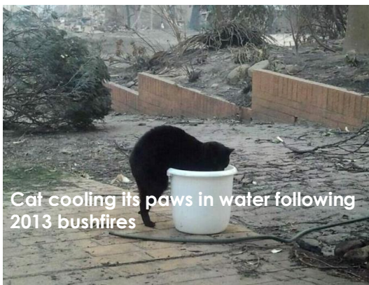
Cat cooling its paws in water following 2013 bushfires

In this study we have been working to support and document the setting-up of a community-led group that is looking to progress animal emergency management in the mountains, working directly with the community.