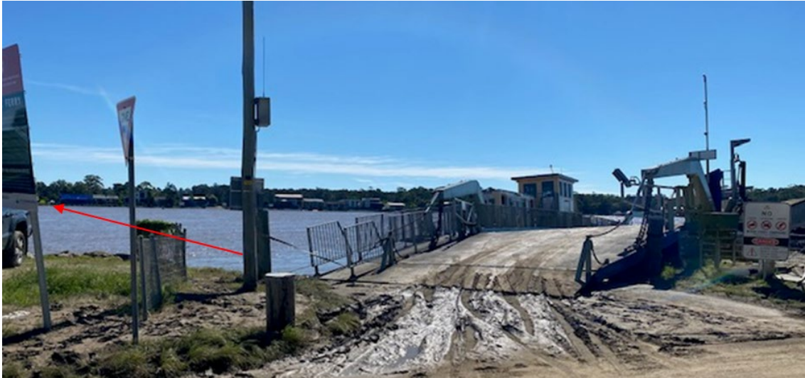
FIGURE 5. THE SETTLEMENT POINT FERRY AGROUND AND FACING ~45° DOWNSTREAM AFTER IT'S STEEL GUIDING CABLES RUPTURED BY THE VELOCITY OF THE HASTING RIVER FLOW. RED ARROW INDICATES THE FERRY'S USUAL DIRECTION OF TRAVEL AND WHERE THE FERRY WAS LOCATED ON THE OPPOSITE BANK PRIOR TO THE CABLES RUPTURING.

some businesses including a cafe and bed and breakfasts and the ferry (Figure 5). Emergency services and the Australian Defence Force were using shovels, bobcats and other machinery to move mud and debris, and the entire street was lined with piles of damaged furniture, spoiled groceries and white goods.