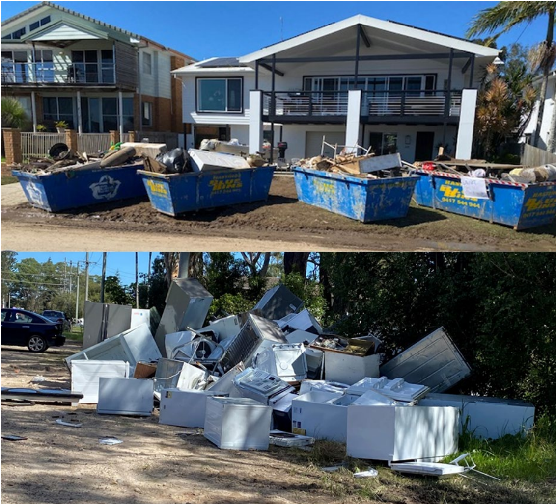
FIGURE 9. SKIP BINS FULL OF WATER DAMAGED BELONGINGS (TOP), A COMMON SIGHT THROUGH MANY OF THE SURVEYED NEIGHBOURHOODS. PILES OF WHITEGOODS SUCH AS FRIDGES, FREEZERS, WASHERS AND DRYERS WERE FREQUENTLY ENCOUNTERED (E.G. NORTH HAVEN, BOTTOM)

Risk Frontiers has recently undertaken another field trip to survey flood damage in Western Sydney and the findings will be reported in a follow-up Briefing Note.