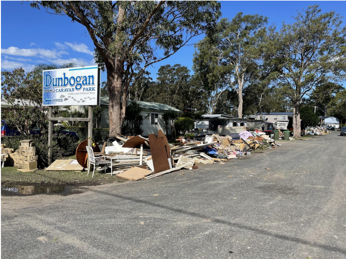
FIGURE 8. A CARAVAN PARK IN DUNBOGAN IN CLOSE PROXIMITY TO THE INLET THAT HAD BEEN HEAVILY IMPACTED.