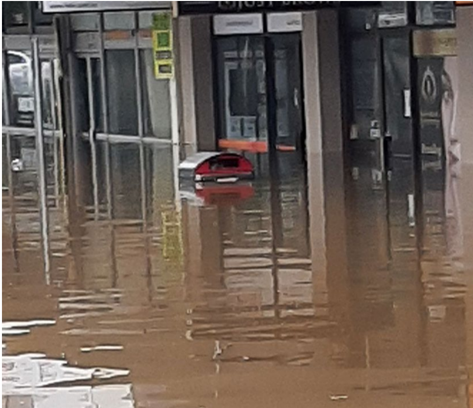
FIGURE 7. WATER LEVEL AT THE SOUTH WEST END OF SHORT STREET, PORT MACQUARIE