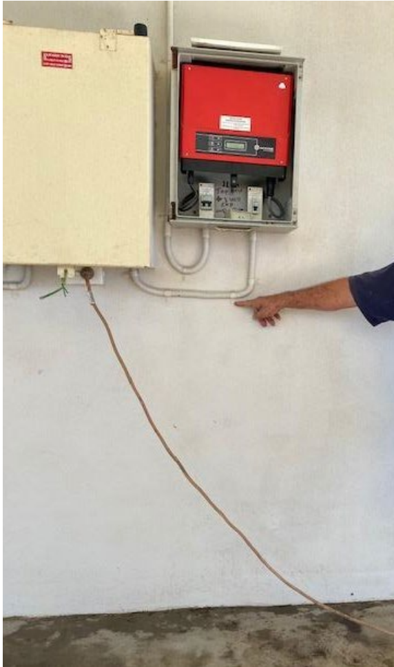
FIGURE 6. A RESIDENT FROM SETTLEMENT POINT ROAD, PORT MACQUARIE INDICATING THE PEAK WATER LEVEL FROM THE FLOOD ON AN EXTERNAL WALL OF HIS HOME.

In the CBD, an office supply and consumer electronics business on one side of Short Street reported water depths as ankle deep (27cm), with an estimated $20-$40k damage (insured), mainly furniture products. Water entered through the front door gap and rear dock. The worst affected businesses on the other side of the street experienced depths almost above the pedestrian curbside rubbish bins (Figure 7), with a printer and fax shop, a sushi restaurant, and a tobacconist, losing most of their stock. The maximum water height on the inside of these businesses ranged from 80cm to 120cm.