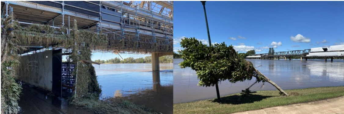
FIGURE 3. THE MANNING RIVER ADJACENT TO THE TAREE CBD. THE VEGETATION DEBRIS (LEFT) AND WATER HEIGHT (RIGHT) ON THE MARTIN BRIDGE INDICATE THE FLOOD PEAK.

As can be seen, return period estimates of river flood depths were, in general, considerably lower than those estimates obtained from rain gauges.