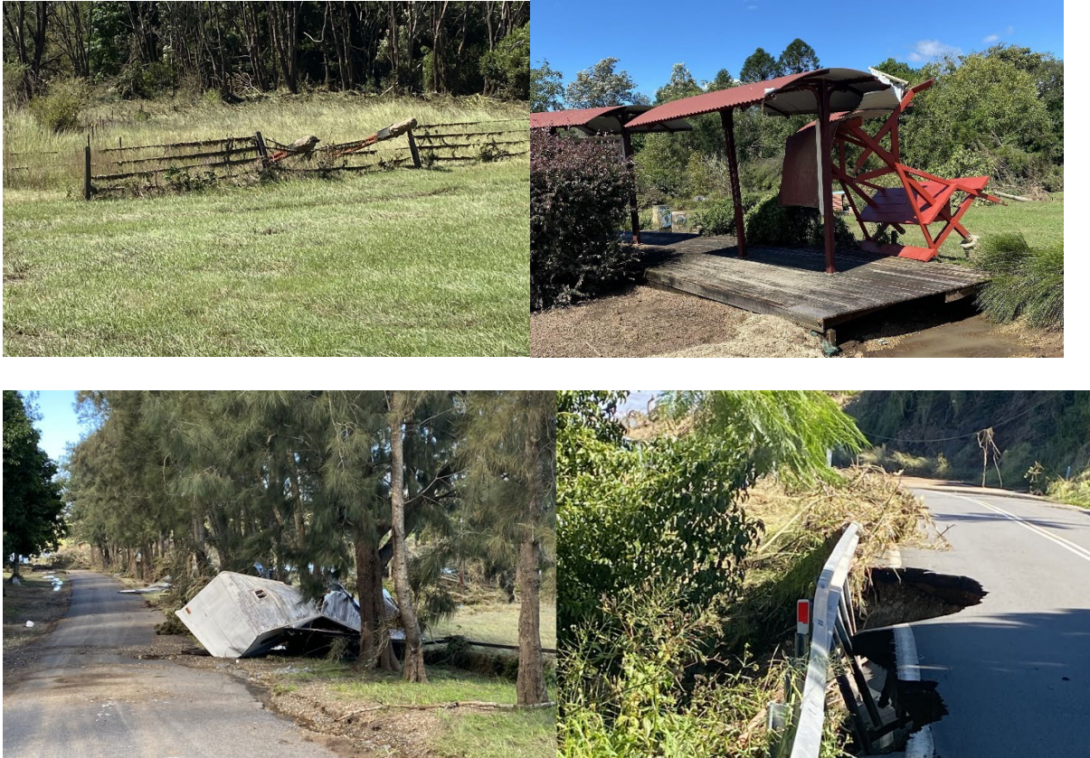
FIGURE 4. POST-FLOODING IMPACTS AT WINGHAM. CHRISSY GOLLAN PARK (TOP), DEBRIS SCATTERED ACROSS THE FLOODPLAIN INCLUDING THIS CARAVAN WRAPPED AROUND A TREE (BOTTOM LEFT) AND THE CLOSURE OF TINONEE ROAD (BOTTOM RIGHT) DUE TO SUBSIDENCE.

Tinonee Road was still underwater and closed with visible subsidence pictured in Figure 4. On Farquhar Street, we found examples of how powerful and damaging the flood waters were with heavy white goods strewn in the grass, many large scraps from farm buildings, and even an entire caravan wrapped around a tree (bottom left image of Figure 4). Saplings and shorter trees in the nearby floodplain were completely bent over, if not uprooted and carried from elsewhere.